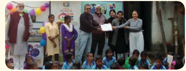
Shreeja India (Birbhum & Bardhaman)