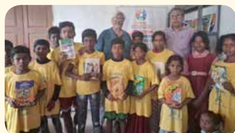
Purono Kolkatar Golpo (Nayachar, East Midnapur)